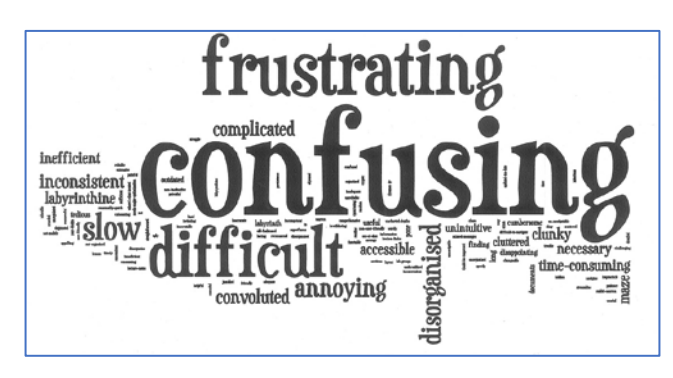
Figure 1: Student-reported experiences of the LMS

Dissatisfaction with the LMS was the overwhelming response from the Medical School community. Students found the LMS confusing and difficult to use, and it hampered rather than supported their ability to study effectively. Navigation problems were the main source of complaint, with resources and assignments difficult to find and use, and many course sites filled with dense information that was hard to extricate. Overall, students rated their experience with the Medical School LMS sites as average to poor. In response to the question, "What three words would you use to describe your experience with the LMS, students indicated they found it 'confusing', 'frustrating', 'difficult', and 'slow' (Figure 1).